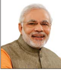
Shri Narendra Modi